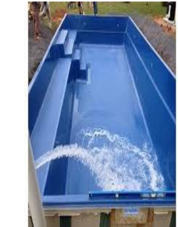
GRP LINING & GRP WORKS.